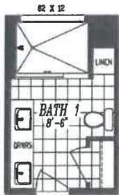
OPT 48 X 72 SHWR W/ DBL LAVS