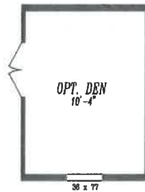
OPT. DEN I.P.O BEDROOM