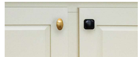
L: Brushed Brass Egg Knob R: Matte Black Square Knob