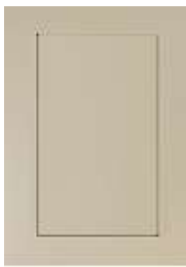
Studio Beige Shaker Frame Cabinets Primary Kitchen and Bathroom Cabinets