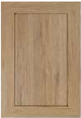
Bishop Oak Shaker Frame Cabinets Primary Kitchen and Bathroom Cabinets