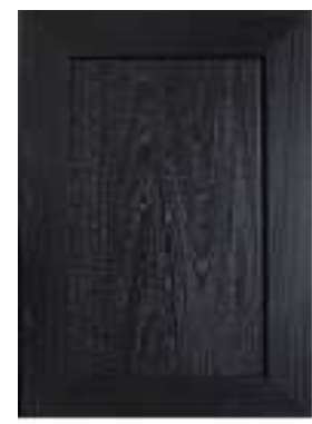
Onyx Shaker Frame Cabinets Kitchen Island Cabinets