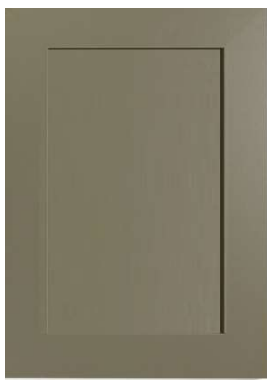
Plover Shaker Frame Cabinets Kitchen Island Cabinets